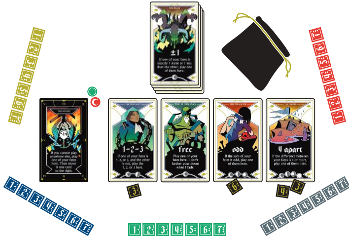
Example setup for 5 players on Easy difficulty after several fates have been played.

The Hours is a special card that is always in play face-up . It has a dark background, as opposed to arcana cards. It includes a score track and lacks a duration. It has no ability on its back side, as it will never fade and cannot leave play or be cycled. The Hours card is not considered an arcana card.